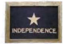
TEXAS INDEPENDENCE FLAG