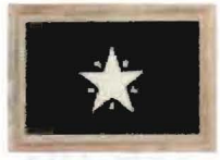
UNOFFICIAL DeZAVALA VARIATION FLAG;